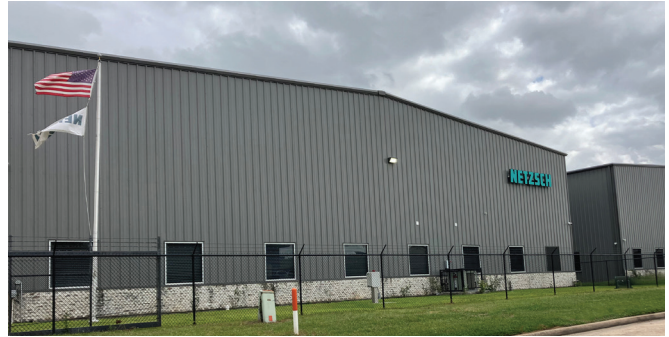
NETZSCH Pumps USA – Houston 1511 FM 1960 Road, Houston, TX 77073